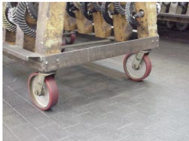
Spindle rack for gear blanks. T/R compound soft polyurethane is floor protective and will not pick up machine shavings or debris.

Excellent for dollies, waste disposal trucks, warehouse trucks, proof or cooling racks, portable work benches, floor trucks, shop carts, drywall dollies, trailer frames, wire shelving units, tool boxes, laundry distribution carts, manual lifting devices, unitized dairy distribution carts and other medium duty applications.