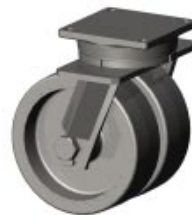
Angle Reinforced Legs