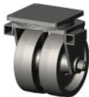
Caster With Steering Tubes